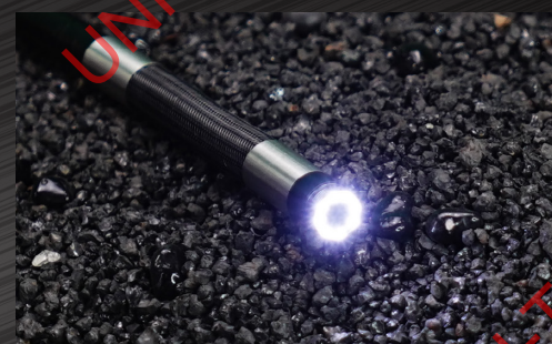
Photo Capture, Video Recording, and Audio Recording.

8 LEDs, 4-Setting for brightness adjustment