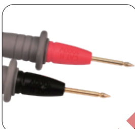
Gold plated test leads