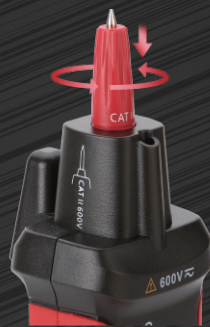
CAT III 600V