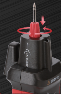
CAT II 600V