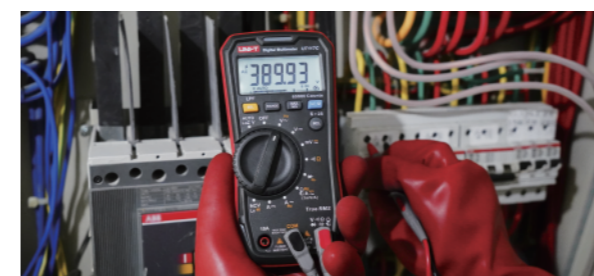
AC voltage measurement