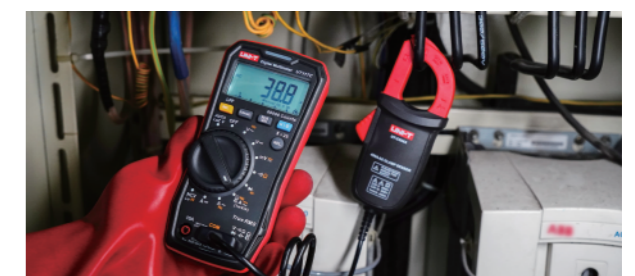
AC Current measurement